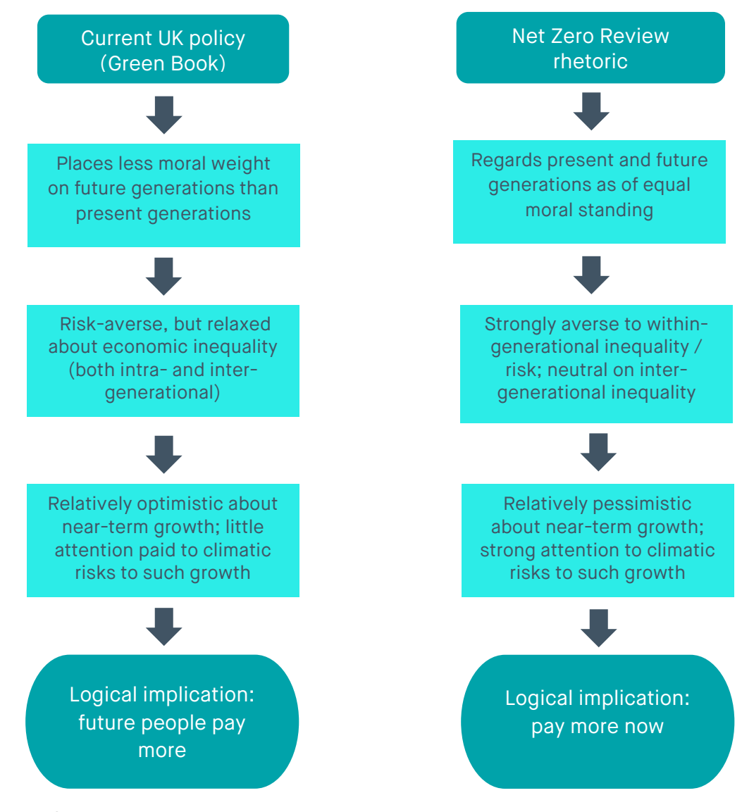
Figure 1: Alternative policy options regarding how much to pay

The Net Zero Review's assumptions also logically imply that we should lower the discount rate, again meaning that we should spend more now. In terms of the weight it places on the moral value of future generations, the Net Zero Review is much closer to a previous "review" – the 2006 Stern Review on the economics of climate change – than it is to existing UK policy as embodied in the Green Book. Compared to the Green Book, Stern adopted a much stronger moral attitude to future generations (namely the view that they have equal moral value), leading him to a lower discount rate. Moreover, while the Net Zero Review is arguably similar to both Stern and the Green Book in its neutrality towards intergenerational inequality of income, it exhibits a greater degree of aversion to inequality within a single generation, and is arguably more pessimistic about near-term growth and risks to such growth. All of these things would imply a lower discount rate, implying that we should spend more now to avert future costs.